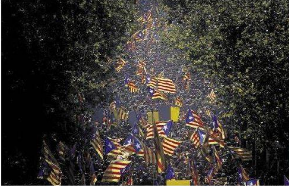
The other secessionists A week before Scotland holds its independence vote, supporters of Catalonia's separation from Spain marched in Barcelona. PAGE 4